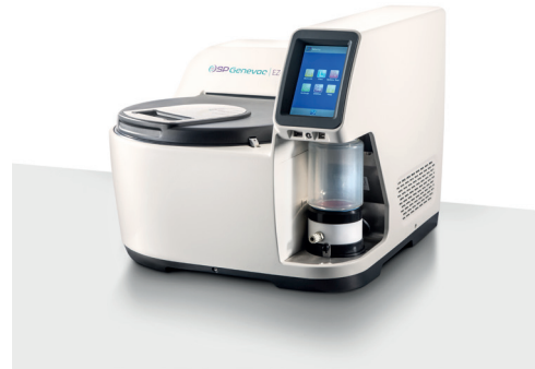
Figure 1 - EZ-2 4.0 Personal Concentrator

WTCHG had an elderly vacuum concentrator which could accept only two plates at a time, and took up to 3 hours to dry them. Therefore it took two weeks to dry all the plates after each run. To preserve the integrity of the plates awaiting drying these were frozen at -18^{\circ}\text{C} , and thawed when the concentrator was available. It is well documented in the literature that freeze thaw cycles can be detrimental to oligo quality and can cause degradation. WTCHG began to search for a new high throughput concentrator which could keep up with their microarray production. The system they selected was the Genevac EZ-2 personal evaporator (Figure 1 † ). The EZ-2 can take eight plates per run, and dries them in just over an hour, meaning that all the plates for a microarray printing run can be dried within one day.