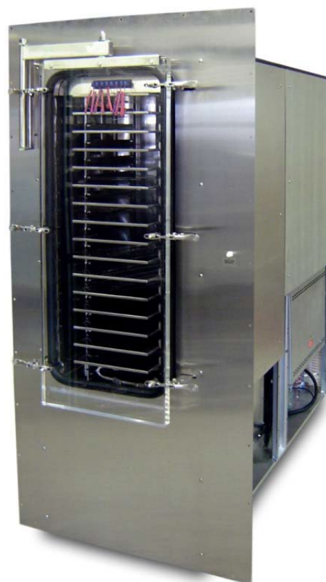
Cleanroom configuration shown.

Note: Other electrical configurations available.