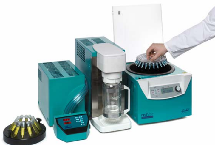
Figure 2: miVac Duo concentrator system

The extracts were dried using either a Turbovap (Zymark) with nitrogen gas supply and water bath set to 35°C or a miVac DUO with Quattro pump (Genevac – Figure 2). The samples were analysed on a 4000 Q TRAP (Applied Biosystems) with a gradient separation (Agilent 1100, CapPump Binary) using a XBridge Shield RP18 3.5µm 1.0 x 150mm column. Solvent A consisted of 95% H 2 O 5% acetonitrile and solvent B consisted of 90% acetonitrile 10% H 2 O both A and B had 0.2% formic acid. The gradient was constant from 0 to 2 minutes at 85% A, then reduced to 32.5% A to 14 minutes, solvent A increased back to 85% at 15 minutes and equilibrated the column at 85% A till 20 minutes.