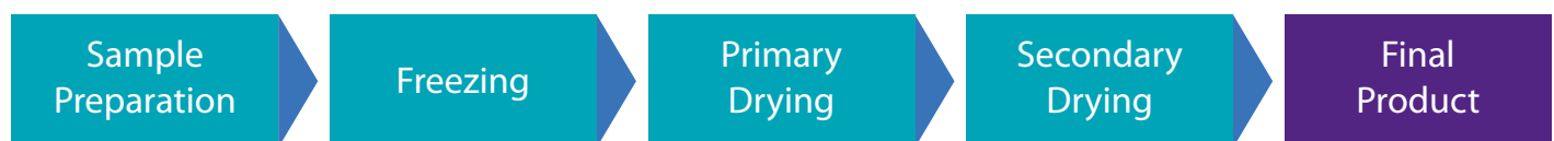
Figure 1: An overview of the lyophilization process

A critical step in the fill-finish manufacturing process, lyophilization removes water from the product after it has been frozen. Modern lyophilization systems utilize an inert gas and pressurization and rapid depressurization to create instantaneous ice nucleation throughout the product, massively improving heterogeneity, and therefore quality. During drying, the chamber is placed under a vacuum, allowing the ice to change directly from a solid to a vapor without passing through a liquid phase. Process control during freeze-drying is imperative to the product integrity.