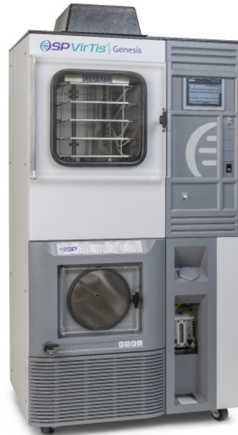
Standard configuration shown.

Note: Other electrical configurations available.