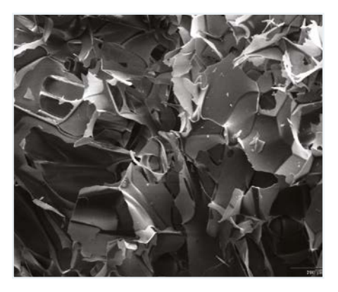
Figure 3: Using controlled nucleation at -3°C ("CL@-3°C")