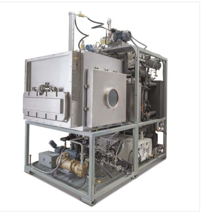
S20 LyoConstellation Freeze Dryer

SP also provides a freeze dryer refurbishing service to extend the life of existing equipment by updating, repairing, refurbishing, retrofitting previously owned lyophilization systems including retrofitting and upgrading controls system. This LyoRenewal capability enables each installation to be customized to the company's standard operating and control procedures and other site requirements or corporate policies.