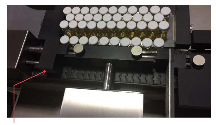
A servo driven backstop will stop the row of vials in the proper position for a close pack configuration. This feature is recipe driven.