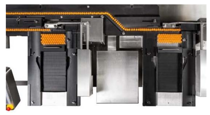
For faster production speeds (above 400 vials per minute), the two tray stations can be fed independently.

SP Hull Tray Loaders incorporate a buffer plate located in front of the receiving tray. The pusher will start to collate vials in a row by row nested configuration. Once the row count has been achieved, the pusher will complete a long stroke to fill the tray. The pusher will then return to its initial position and start to collate vials in short row by row strokes providing the operator sufficient time to remove the full tray and replace an empty, without stopping production.