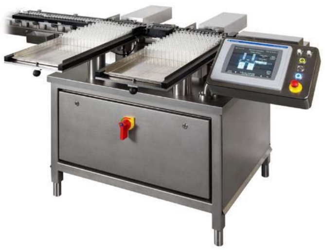
SP Hull TL-200 Tray Loader - Assuming 305 mm (12 in) Wide Tray