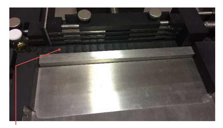
The SP Hull Tray Loaders have an adjustable pusher to accommodate different vial patterns without the need of change parts.