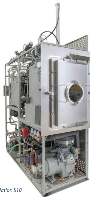
SP Hull LyoConstellation S10 Pilot Lyophilizer